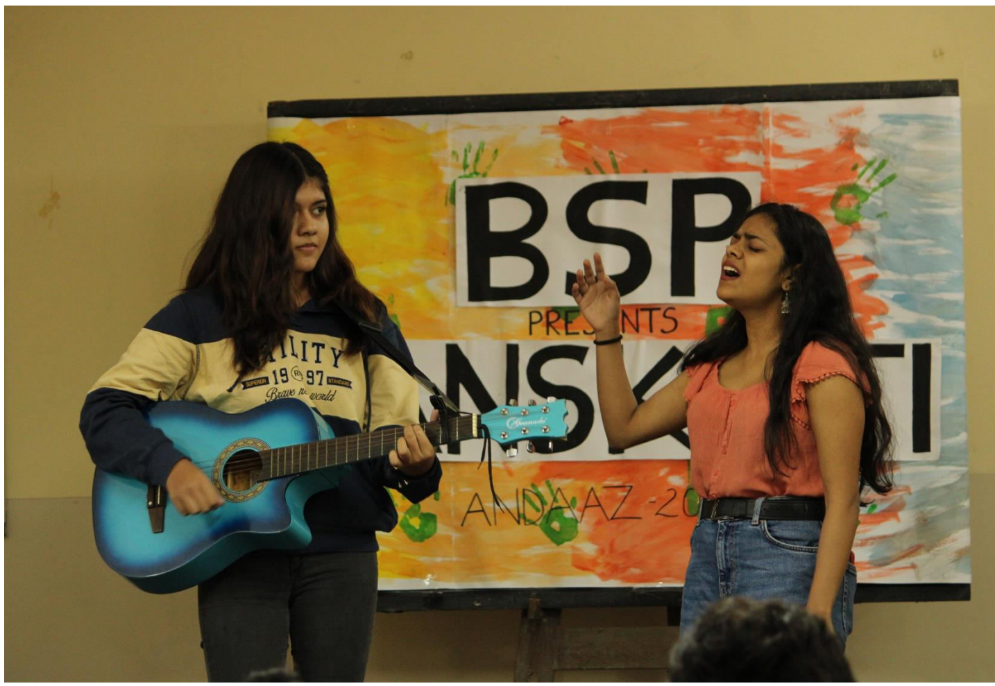
Singing competition at Sanskriti