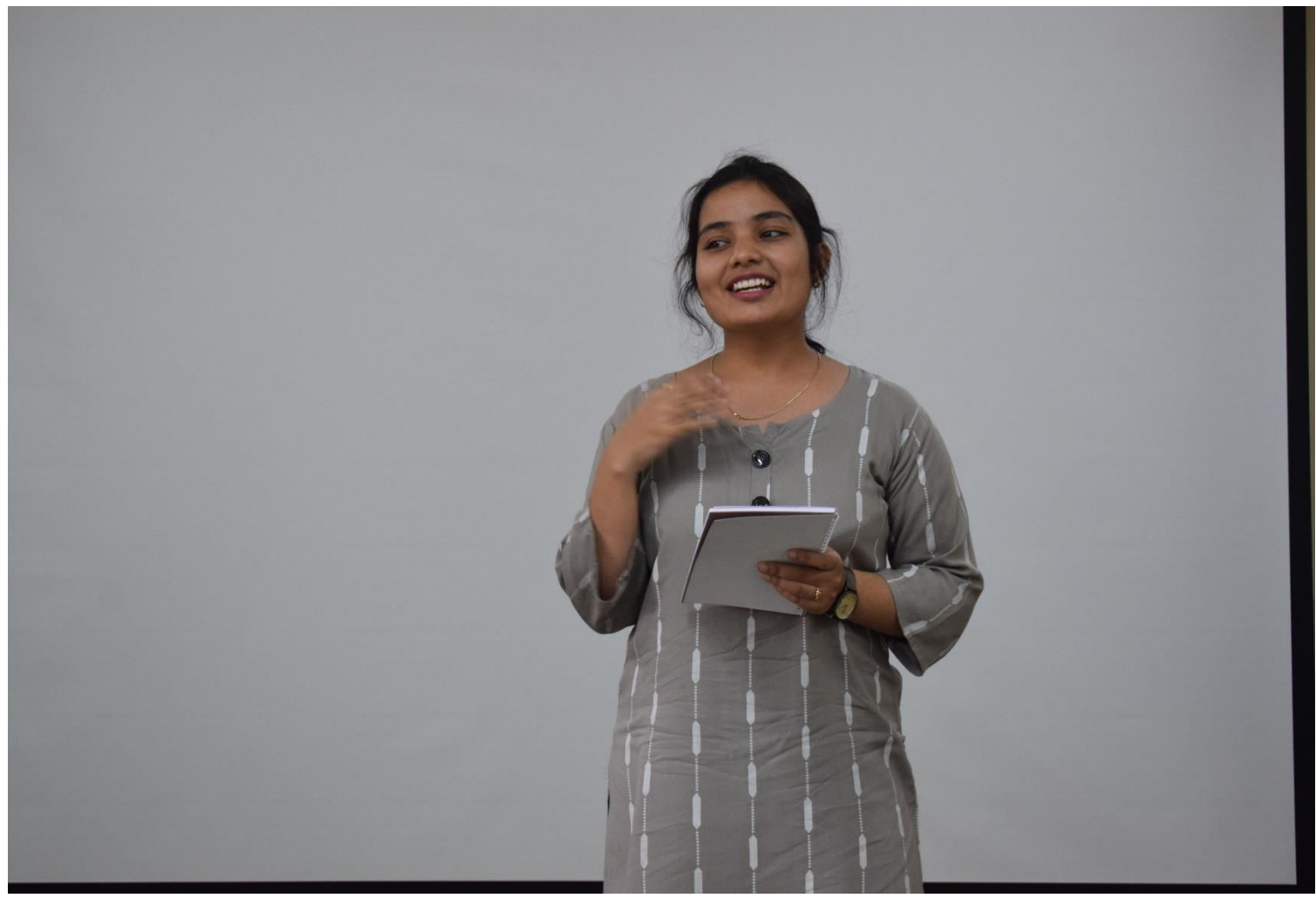
Poetry Performance Competition